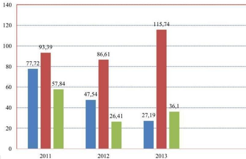
Figure 5.1: Turkish Assistance to Somalia and Sub-Sahara Africa