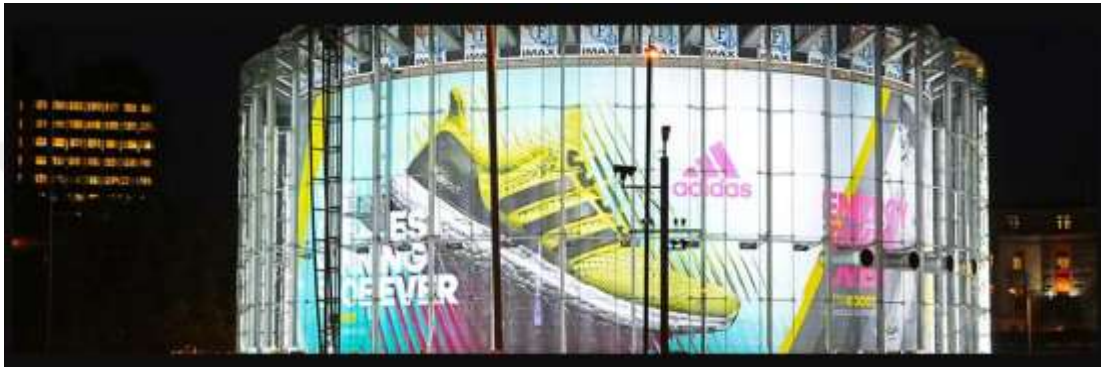
Figure 2.3: Illuminated Digital Advertisements

Illuminated digital advertising tools, such as billboards, which are placed in areas with heavy pedestrian and vehicle traffic, differ according to their usage areas, are modern advertising tools in which technological opportunities are used. These tools, which appear in the advertising market with their small models such as liquid screens and flowing texts, have become expensive advertisements that have become television quality images, and have become preferred especially in large squares and transition areas (Suggett, 2020).