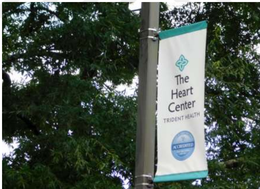
Figure 2.2: Currency and Banners

Currency and banners, which are smaller in size than posters and can be used indoors and outdoors, are types of outdoor advertisements made of cloth or nylon material, mostly containing short messages, slogans and announcements (AzBanners, 2022).