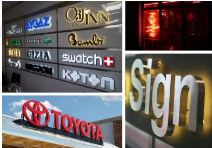
Figure 2.5: Box Letters