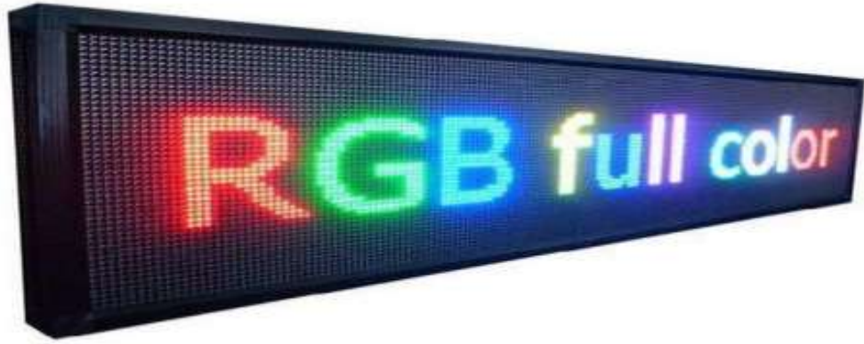
Figure 2.4: Led Display Advertisements and Neon Advertisements