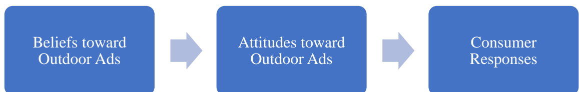
Figure 3.1: Research Model

The model of the study includes Beliefs Toward Outdoor Advertising is in the role of independent variable, Attitude Toward Outdoor Advertising is mediator variable, and Consumer Responses plays dependent variable role in the model.