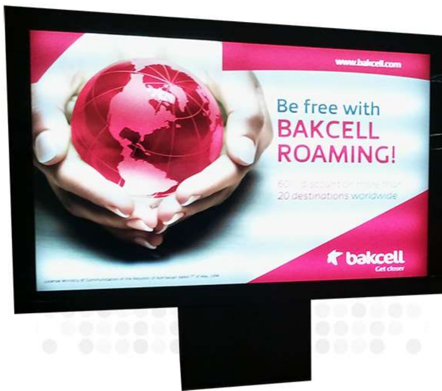
Figure 2.1: Megalights

Megalights placed at important points in the cities where the view is clear, while providing the target audience, carry the corporate image to the upper levels. Megalights are modern advertising spaces that can carry messages day and night, thanks to their appearance in harmony with the urban texture. As a result of the enlargement, lighting and framing of billboards with different boxes, these tools have led to the emergence of large, very high, fixed, illuminated advertising vehicles that do not have certain standards. These advertising tools are generally called megalight, in the sense of mega-light.