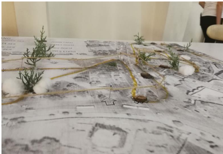
Figure 5. Sensory Map (below)