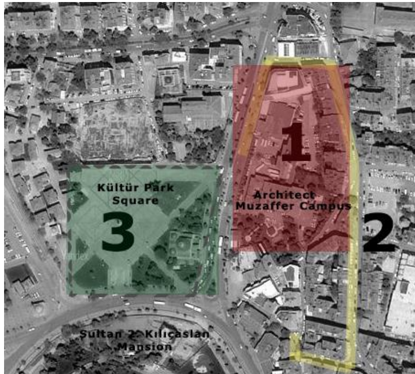
Figure 2. Area Map

Two students were selected for each study area and students from different disciplines were matched for each region. Students have been in their area for 2 hours and have experienced their routes. The study was conducted in May at a temperature of 23 degrees Celsius and from 10:30 to 12:30 hours.